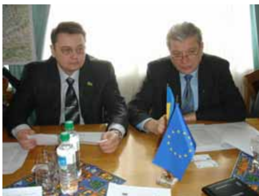
Photo II. Meeting with Head of Sumy Oblast Administration and Oblast Council, 20 February 2008

During the quarter, CBA Project Manager visited 17 oblasts to hold 14 Regional Seminars and have 8 Partnership Agreements signed by OSA/OC. (see Annex 1 for summary of regional visits).