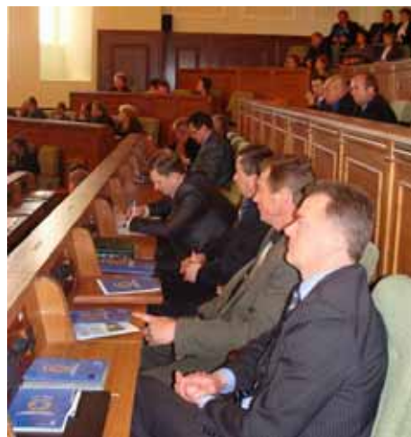
Photo IV. Audience of CBA Regional Seminar