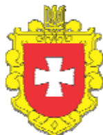
Rivne Oblast State Administration and Council