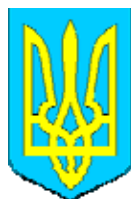
Secretariat of the Cabinet of Ministers of Ukraine