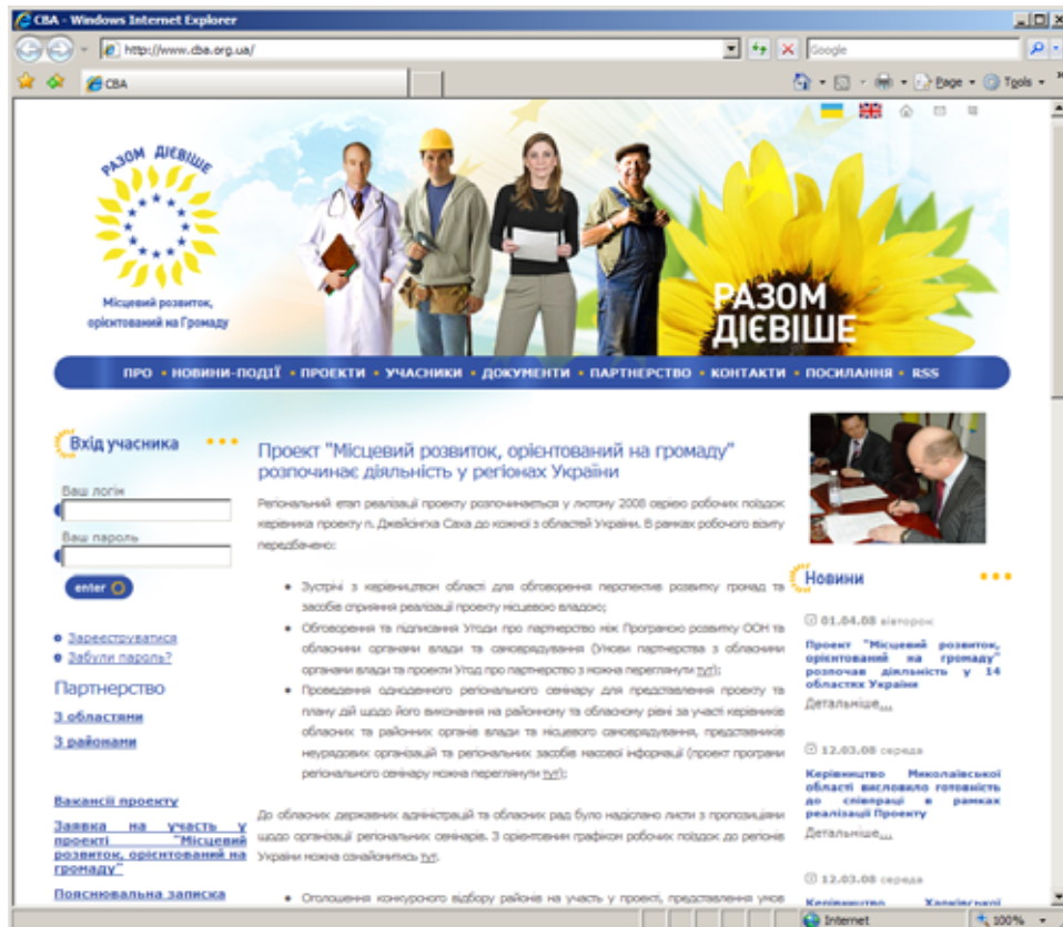
Box V: Initial version of CBA web site