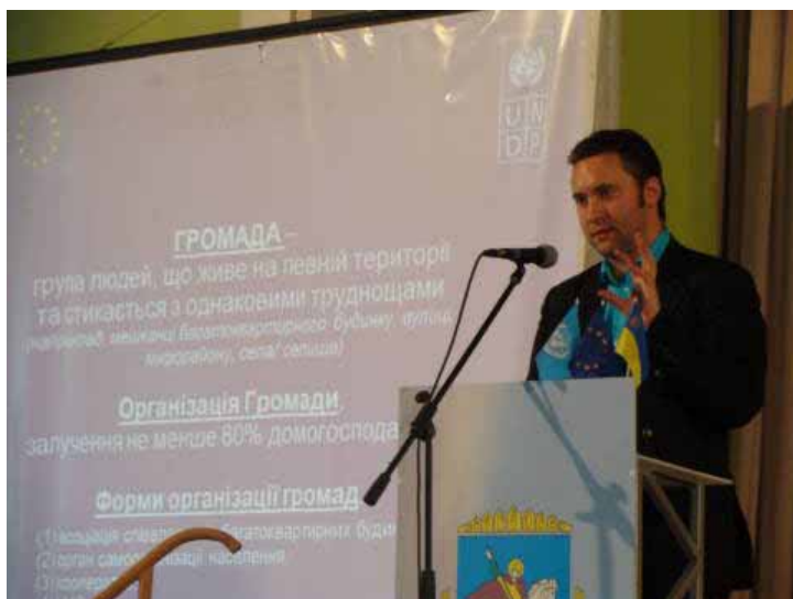
Photo III. Presentation of Community Based Approach

In his opening statement, CBA Project Manager focused on Project genesis, highlighting previous EU Tacis and UNDP experiences in implementing initiatives on regional / local development. During the seminar, details about the genesis, modus operandi, terms of partnership and application formalities were also provided. To exemplify the use of community-based approach, Municipal Project Coordinators of MGSDP were invited to share their experience with the audience. As an alternative, the film “A Step Ahead: How Ukrainian Communities Are Helping Themselves” was shown featuring success stories of CRDP, CIDP and MGSDP.