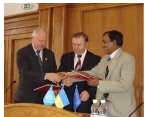
Photo VII. Signing of Partnership Agreement in Kirovohrad, 14 March 2008

As a rule, oblast authorities were eager to develop a tripartite partnership, exception made for the case of Zhytomyr oblast where internal conflict in the Oblast Council did not allow to involve this institution into cooperation. Signing Partnership Agreement was not specified as a precondition for launching Project activities in the region. Where signing did not take place, Regional Seminars were held and call for rayons' participation was announced. At personal meetings, oblast authorities expressed their determination to sign Partnership Agreement at a later date.