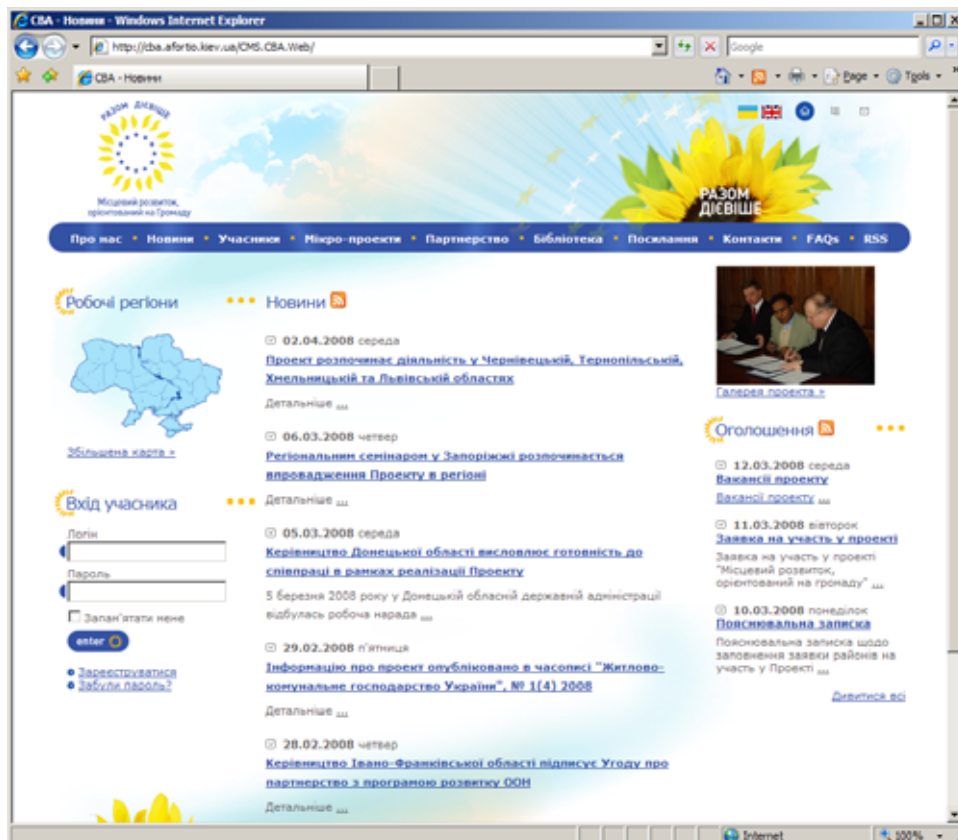
Box VI: Test version of new CBA web portal