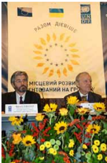
Photo 1. UN Resident Representative Francis O'Donnell and Head of the Delegation of European Commission to Ukraine Mr. Ian Boag

The CBA Project commenced on 4 September 2007 with signing of agreement between the Delegation of the European Commission to Ukraine and UNDP Ukraine. National launching of the Project took place on 4 December 2007 in participation of representatives of Delegation of European Commission to Ukraine, UNDP, Secretariat of the Cabinet of Ministers of Ukraine, representatives of Ministries, central and local governments as well as other parties.