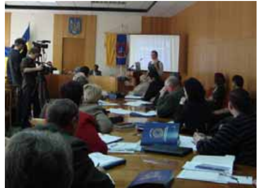
Photo VI. Regional Seminar in Odessa Oblast State Administration, 11 March 2008

During the first few seminars, representatives of rayon authorities drew the attention of PMU team to the fact that filling in the Application Form demanded a great amount of information. This was taken into account and Application Form was simplified.